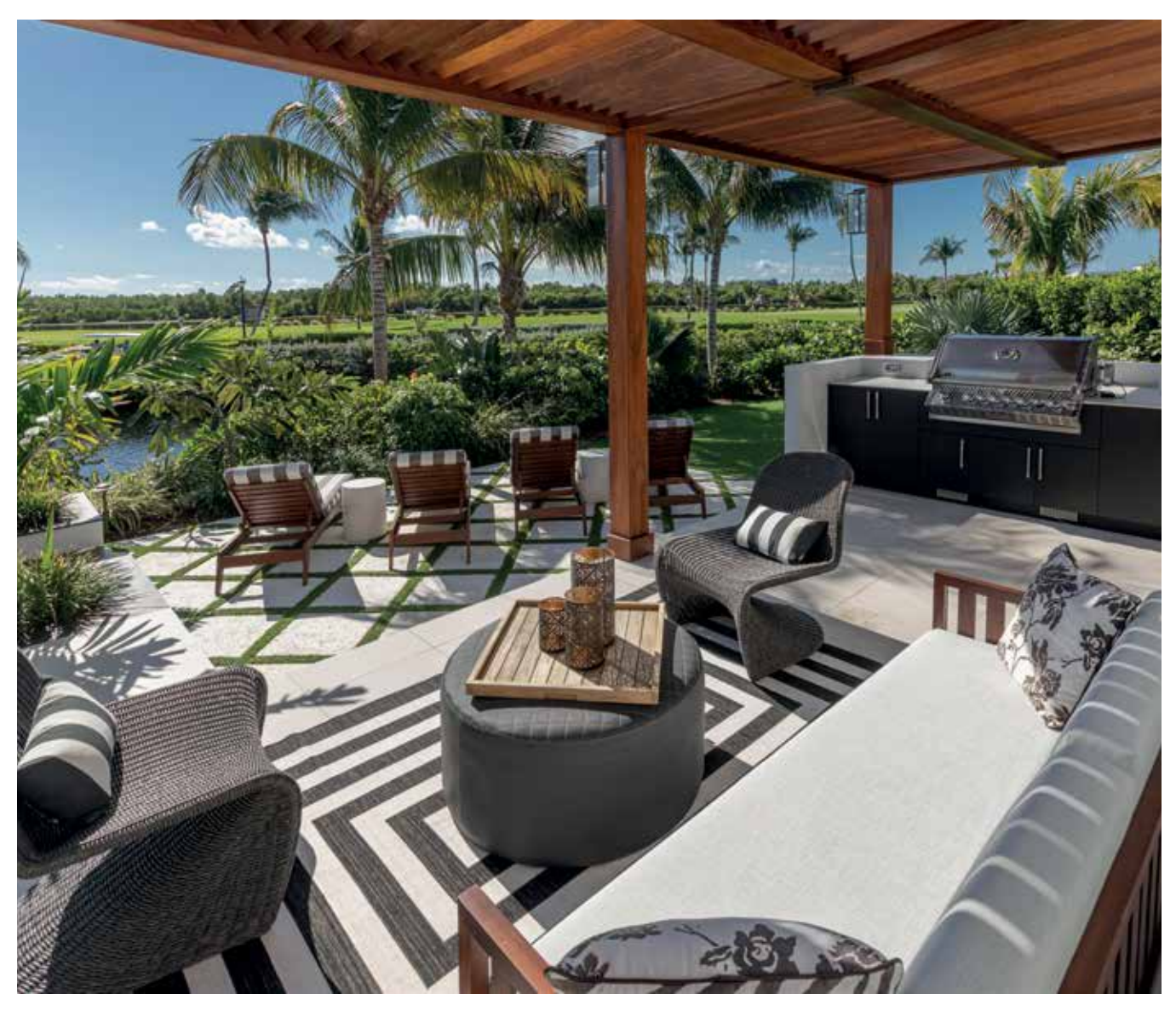
Wide verandas lend themselves to outdoor living.