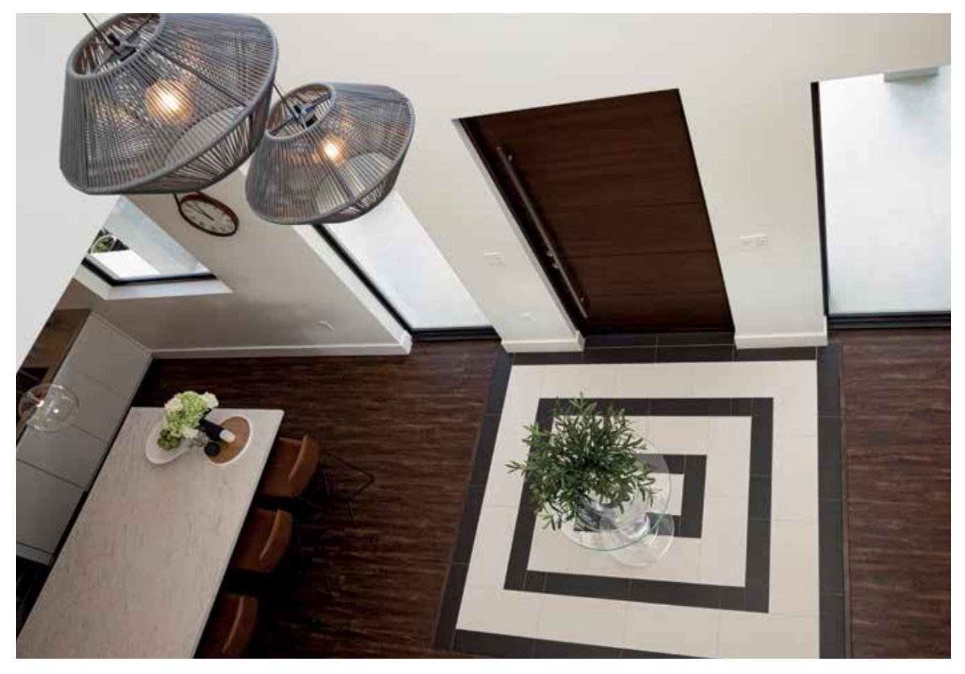
Left: Powder room with custom-made tile. Above: Elegant entranceway.